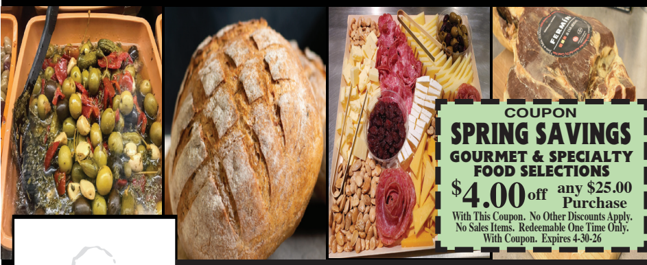
TABLE READY CHARCUTERIE BOARDS AND GIFT BASKETS! • BEST SELECTION OF INTERNATIONAL CHEESES AND GOURMET OLIVES!

COUPON SPRING SAVINGS GOURMET & SPECIALTY FOOD SELECTIONS $4.00 off any $25.00 Purchase With This Coupon. No Other Discounts Apply. No Sales Items. Redeemable One Time Only. With Coupon. Expires 4-30-26